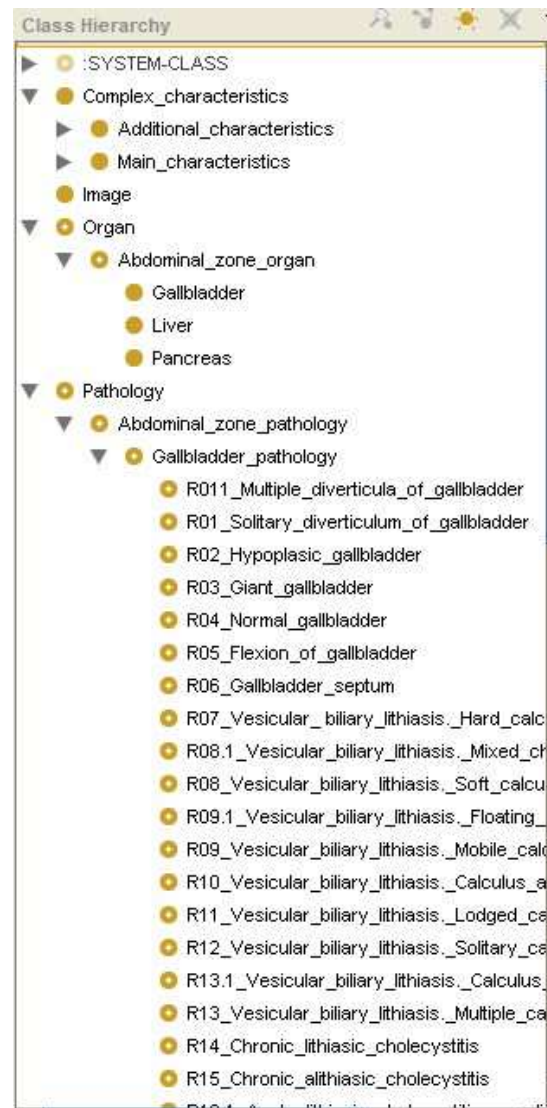
Fig. 2. Class hierarchy for the OUI of hepato-pancreato-biliary zone organs.

Class Complex_characteristics describes the characteristics of the organ: main and additional. It is related with class Pathology , to reflect, to which pathology the given characteristic corresponds.