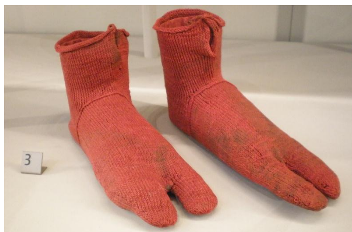
Fig 1. A pair of Egyptian socks [2]

The global fashion industry is expected to increase from 408 Billion US$ in 2017 to over 706 Billion US$ in 2022, rising at a rate of 11.6%. In terms of product type, knitwear are classified into innerwear, t-shirts and shirts, sweaters and jackets, sweatshirts and hoodies, shorts and trousers, evening dresses, suits and leggings, and accessories. Based on material type, it is classified into natural, synthetic, and blended. Based on consumer group, it is segmented into men, women, and kids. [3]