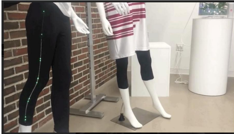
Fig 5. All-black yoga pants with green LED lights [2]

The leggings are being developed through one of the techniques being pioneered at AFFOA for the fabrication of what is called “advanced yarns,” fibers containing conductors, insulators, and semi-conductors—the same necessary ingredients for a computer chip. To make the “yarn,” a cylinder of these three ingredients about 12 inches tall and six inches wide is heated and drawn out until it becomes incredibly thin.[2] In this case, a hair-like black yarn which is then knit into yoga pants. To make these leggings without such yarns, you’d need to manually laminate silicon-mounted LEDs onto the surface of the pants one at a time, creating something uncomfortable, delicate, and very expensive. AFFOA’s version, on the other hand, is nearly indistinguishable from standard, athleisure-style leggings—except they can light up for a night-time jog.[2]