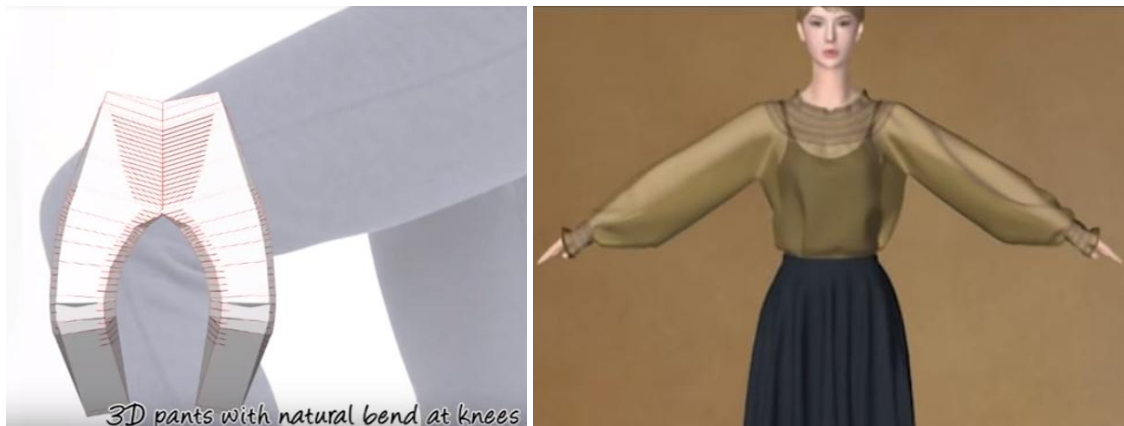
Fig 3. 3D simulation