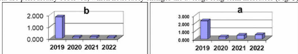
Figure 3. Interannual dynamics of amylolytic bacteria abundance ( N , thousand cells/ml) in the rivers Dniester (Soroca station) and Prut (Braniste station)

In both rivers, the pronounced interannual abundance fluctuations of these physiological groups of bacteria are periodically observed, which noticeably changes the average long-term indicators (Fig. 3).