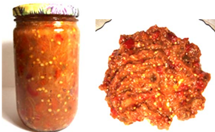
Figure 5. Image of the experimental sample vegetable stew of type „Zacusca”.

Following the sensory evaluation (Table 4) it was concluded that all 5 analyzed indicators presented very good results. The products did not present any objections from the tasting committee and were appreciated with maximum points. At the same time, for a more complex understanding, in figure 5 are presented the photos of the exterior aspect of the elaborated product.