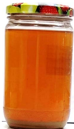
Figure 3. Image of the experimental sample of acidifier from unripe apples Golden Rezistent variety.

The acidifier from unripe apples Golden Rezistent variety harvested in 2019 on the 71 st DAFB was obtained and can be seen in Figure 3. It was later analyzed physicochemically and sensorially in order to be applied to the production of vegetable stew type „Zacusca”.