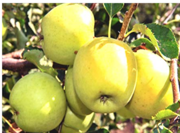
Figure 1. Image of apple fruits of the Golden Rezistent variety [9].

Golden Rezistent is a variety obtained in SUA. It is considered a kind of perspective. The trees are demanding to the soil, have high winter hardiness and secetă. It has stable scab resistance and high resistance to powdery mildew. The fruit is of medium to large size with a mass of 150-160 g, it has a conical-oblong to conical-truncated shape and a smooth surface. Colour of apple is yellow and of pulp is white-cremy. It bears fruit in abundance early and the flowering season is medium. Requires the thinning. The variety is authorized for all areas of the Republic of Moldova [9].