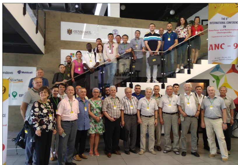
Figure 7. Group photo of International Conference on Amorphous and Nanostructured Chalcogenides, ANC-9, dedicated to the 85 anniversary of the Academician Andrei Andriesh. Chisinau, 1 July 2019.

6. Mott N.. Electrons in glass. Nobel Lecture, 8 December, 1977, Cavendish Laboratory, Cambridge, England.